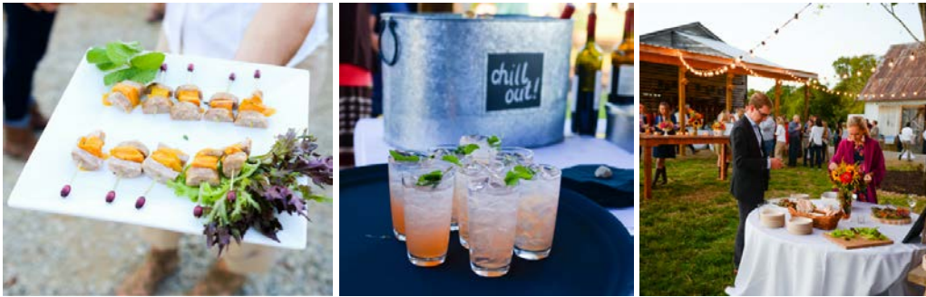
Featuring the Chefs of: