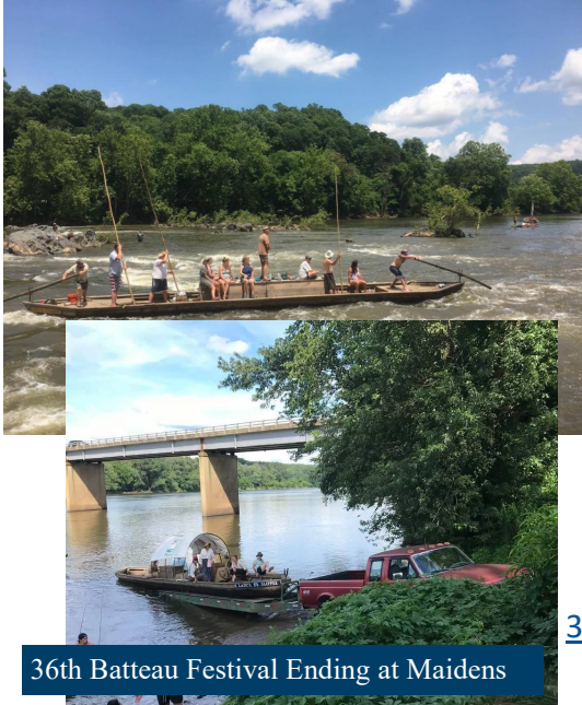
36th Batteau Festival Ending at Maidens

Fine Creek Brewing and Three Crosses Distilling Co. featured in C-VILLE Weekly | Day trip east.