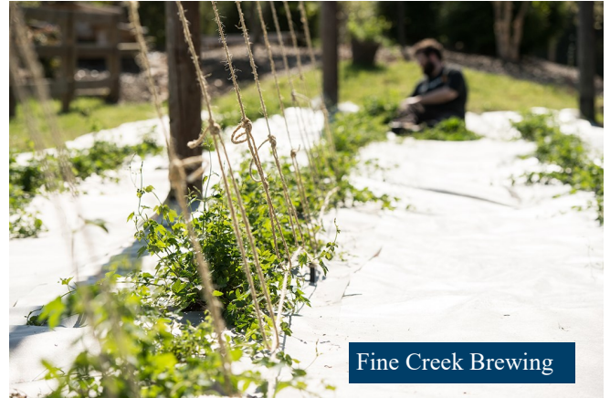
Fine Creek Brewing

36th Batteau Festival kicks off, ends late June in Powhatan | WSET